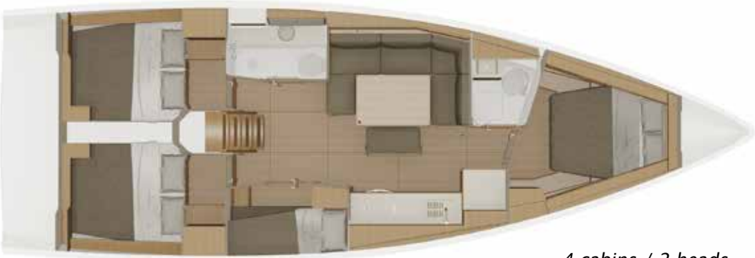
4 cabins / 2 heads