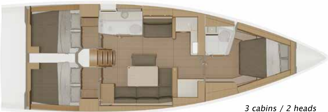
3 cabins / 2 heads