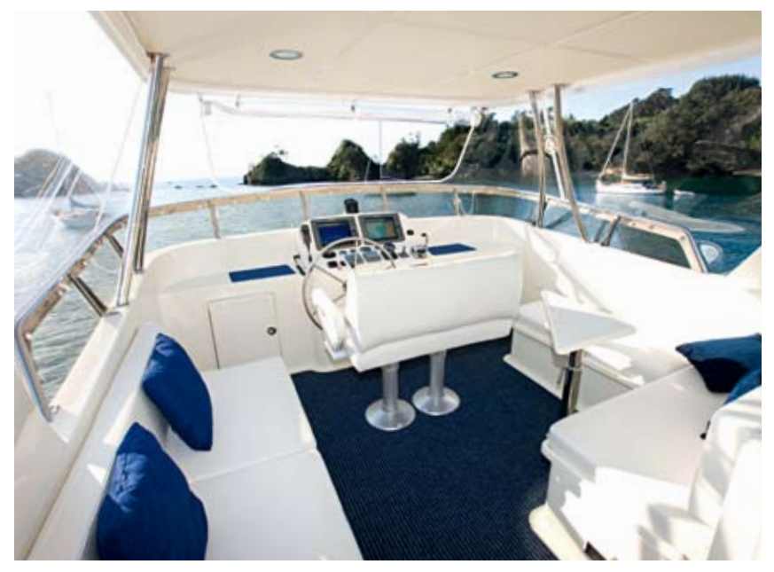
The upper deck is a very useable space, set up aboard Libertar as the main helm station. The adjustable twin helm seat sits on gas struts. Stowage under the settees and forward