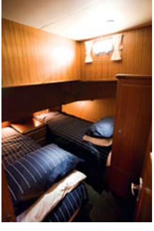
Libertar's guest cabin features two single berths