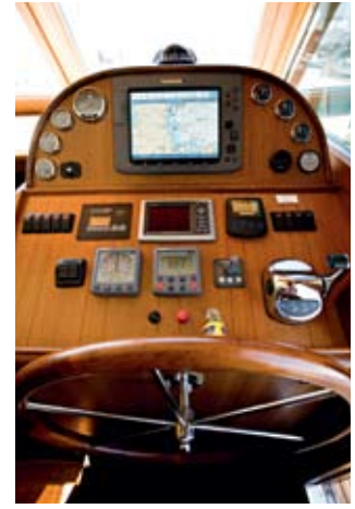
All major helm instruments are duplicated downstairs