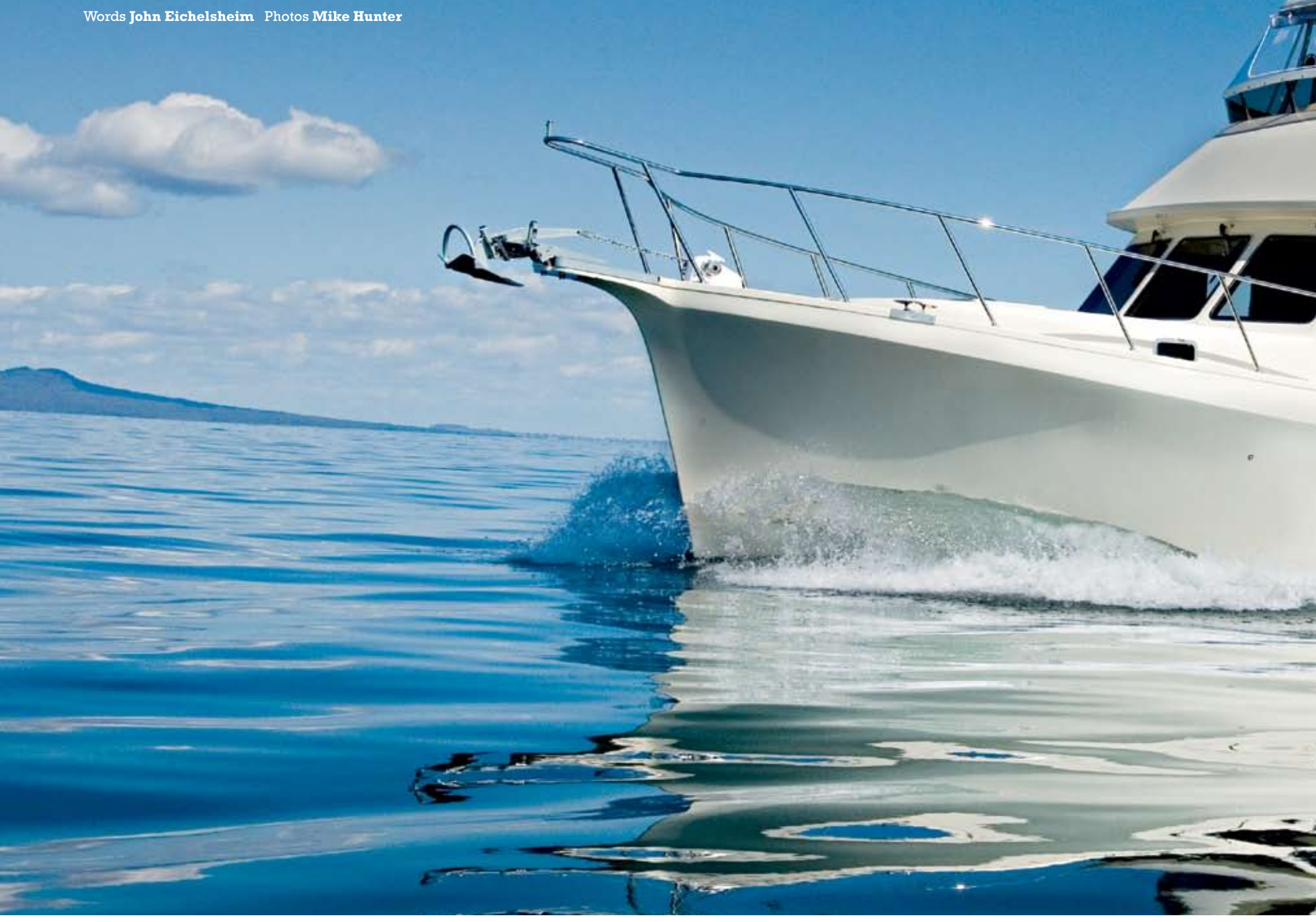
At a glance > loa14.8m > boa 4.35m > engine Cummins QSB 480hp turbo-diesel > cruise speed 9 knots > max speed 13-14 knots > cabins two, master semi-ensuite

The new Clipper 45 motoryacht combines traditional trawler handling with comfortable, economical cruising and relaxed passagemaking - all at a very reasonable price.