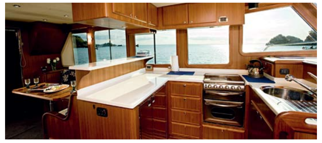
A large, well-equipped galley is a feature of the boat. Gas appliances were purchased in New Zealand and sent to China to be fitted. Overhead lockers provide ample stowage space with more available in two in-bench bins